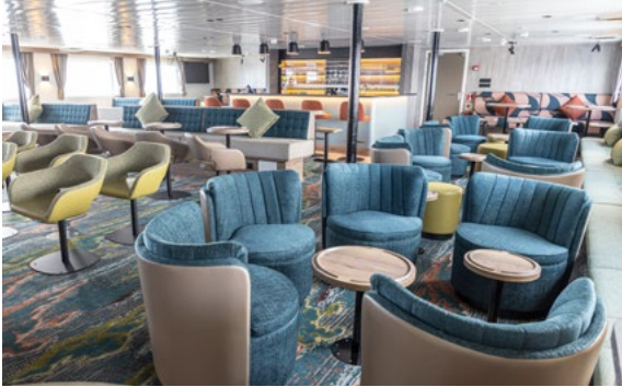
Bar & Observation lounge